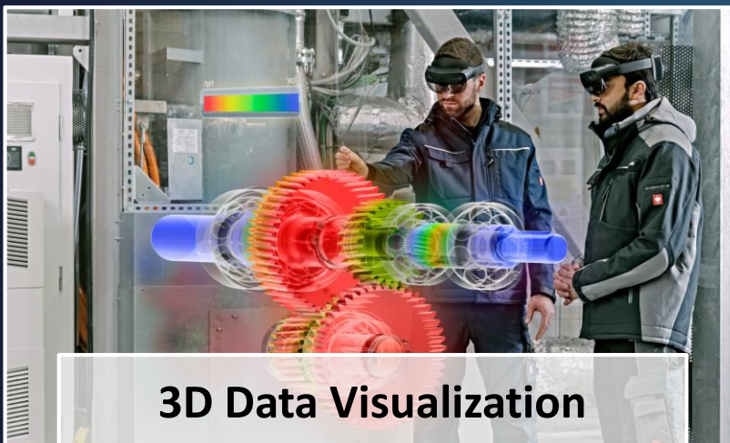
3D Data Visualization