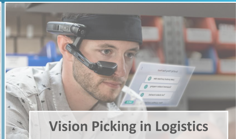
Vision Picking in Logistics